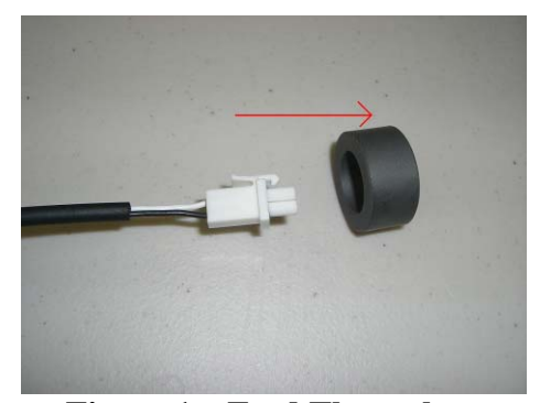
Figure 1 – Feed Through