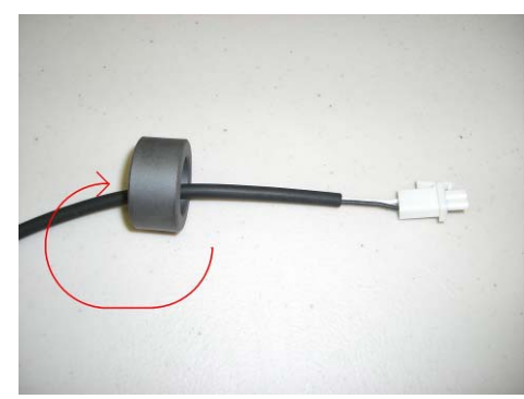
Figure 2 – First Loop