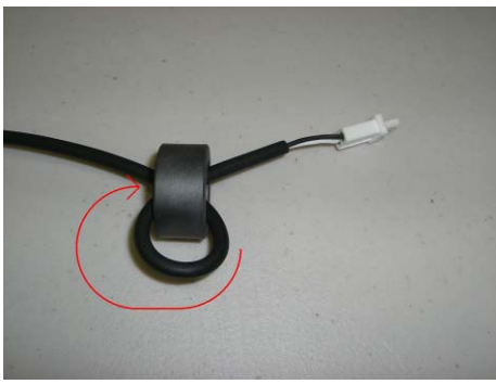
Figure 3 – Second Loop