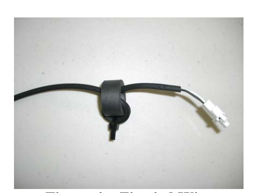
Figure 4 – Zip-tied Wire

NOTE: For maximum efficiency, place the ferrite bead AS CLOSE AS POSSIBLE to the flasher